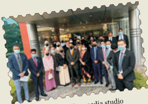
Visit to Indian media studio