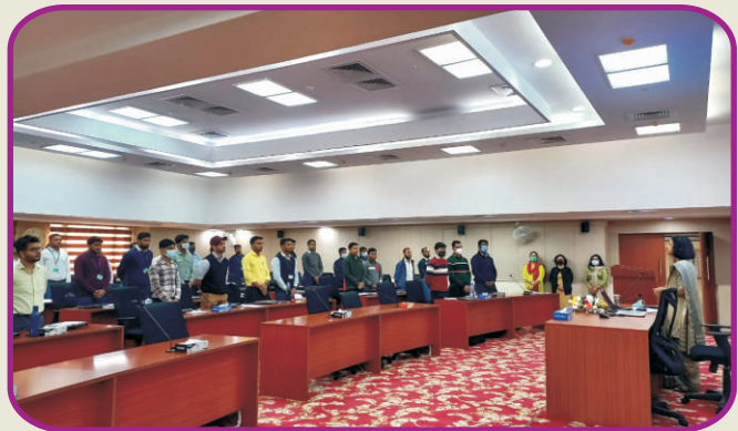
Joint Secretary (SSIFS) administered the Constitution Day pledge on 26 November 2021 to Personal Assistants and Stenographers during their Induction Training Programme