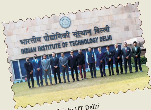
Visit to IIT Delhi