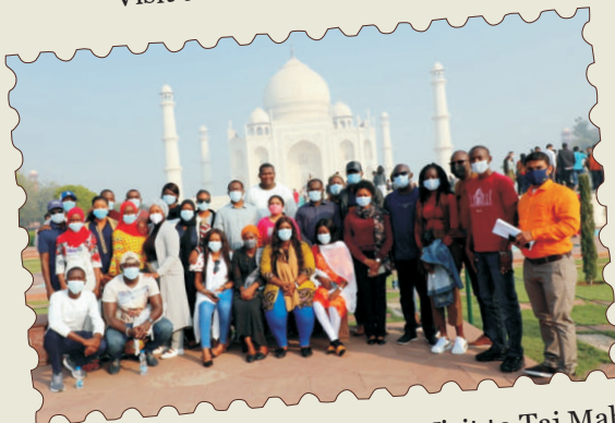
Visit to Taj Mahal and Fatehpur Sikri