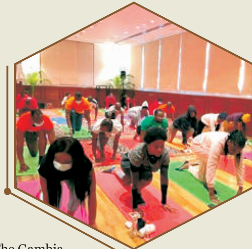
Diplomats from The Gambia participated in the Yoga Session