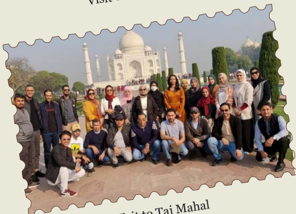
Visit to Taj Mahal