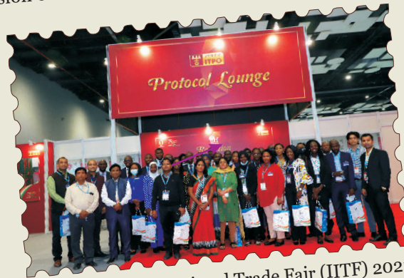
Visit to India International Trade Fair (IITF) 2021