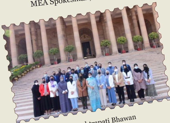
Visit to Rashtrapati Bhawan