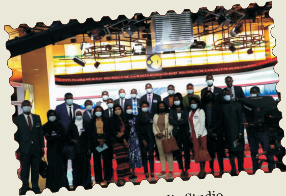
Visit to Media Studio