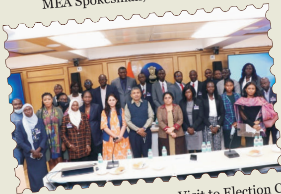
Visit to Election Commission of India (ECI)