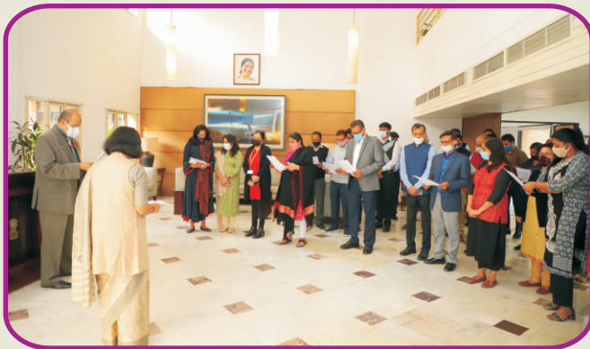
Dean (SSIFS) administered the Constitution Day pledge on 26 November 2021