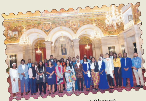
Visit to Rashtrapati Bhavan