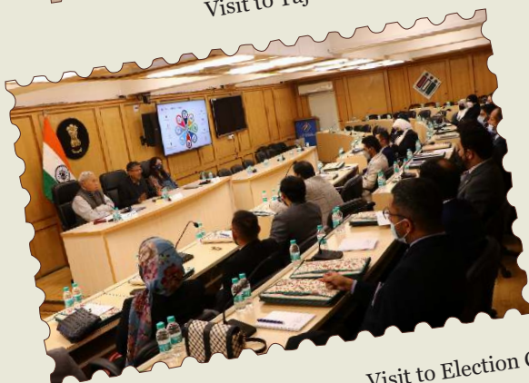
Visit to Election Commission of India