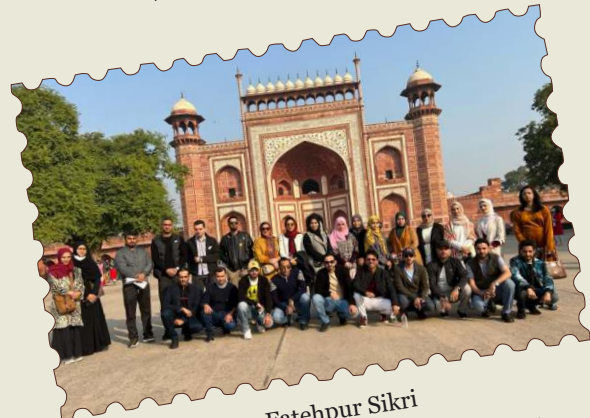
Visit to Fatehpur Sikri