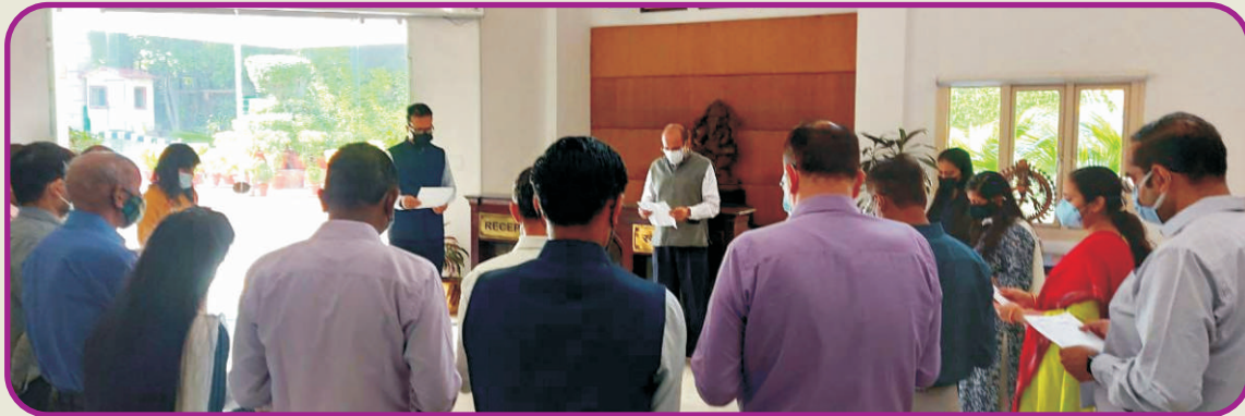
Dean (SSIFS) administered the Rashtriya Ekta Diwas pledge on 31 October 2021