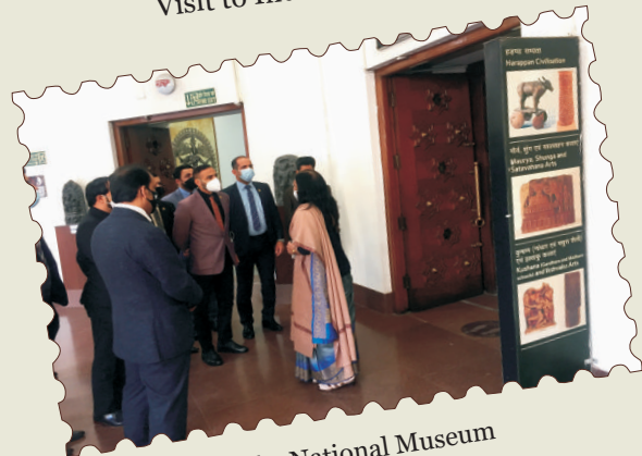
Visit to the National Museum